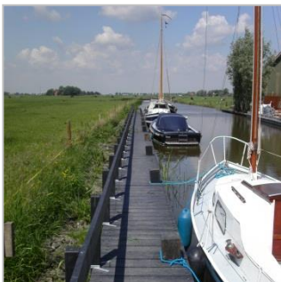
KLP ® Pile Heads

The KLP ® Hollow Pile Head is round and hollow at the bottom and square and solid at the top. The KLP ® Hollow Pile Head can be slid onto the timber pole and be pushed into the soil using a vibrating pile hammer. The solid KLP ® Pile Head , with round bottom and square top, is mounted and attached onto the timber pole using a steel sleeve. The timber pole will be positioned at least 1 metre under water in both cases and the KLP ® (Hollow) Pile Head will be above the waterline.