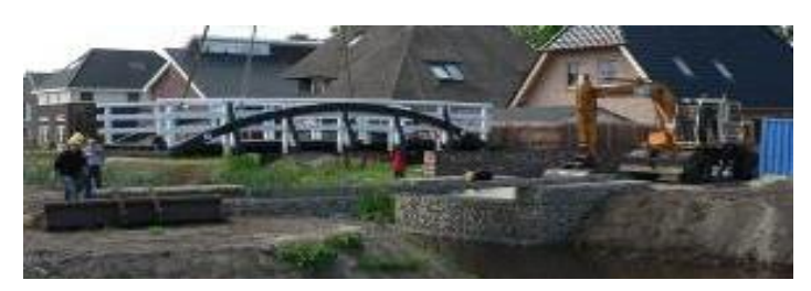
Construction calculations according to Eurocode (NEN-EN 1990/1991).

Empatec makes an increasing range of customized prefab products. This allows Lankhorst to supply its customers with a complete product, such as picnic sets, ramps or prefabricated jetty or bridge segments.