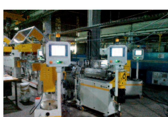
WWW.PURE-COMPOSITES.COM WWW.LANKHORST-EP.COM W W W . L A N K H O R S T T A S E L A A R . N L

The line is highly flexible: single-layered film, multilayered film and also monofilaments can be extruded and stretched. First tests with high performance polymers have