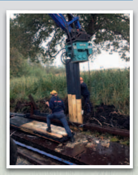
KLP® Sheet piling (Recreatie Midden Nederland).