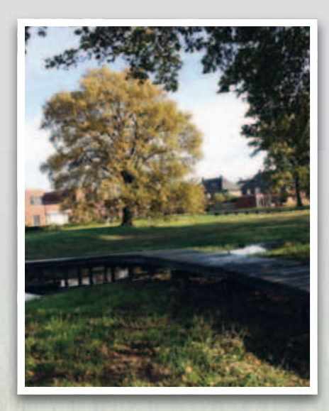
KLP® Walkway (Hengelo, NL).